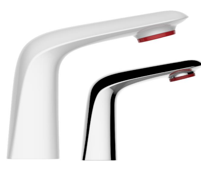
Available in white or chrome